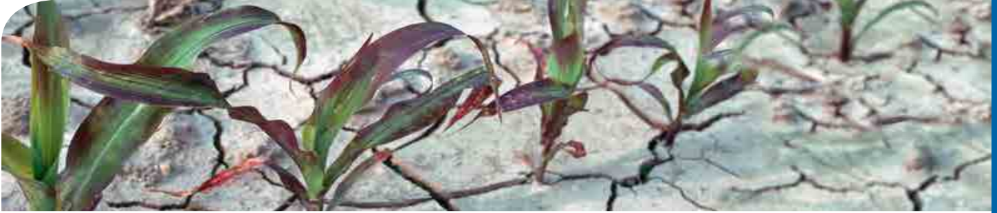
Phosphorus deficiency symptom – corn.

Phosphorus, nitrogen and potassium are the major elements required by soil. However, plants only need one-tenth as much phosphorus as they need nitrogen and potassium. Phosphorus is used by plants to form DNA, RNA and other vital compounds. It is used to store and transfer energy used for growth and reproduction.