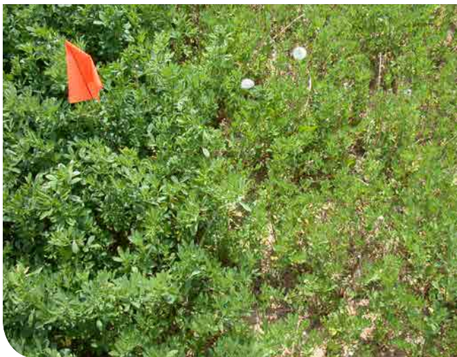
Comparison of alfalfa growth with and without sulfur application

Sulfur is an essential element in forming protein, enzymes, vitamins, and chlorophyll in plants, and nodule development in legumes. There are many forms of sulfur found in the air, soil, and water. However, sulfur is primarily taken up by the plant as sulfate ( \text{SO}_4^{-2} ) from the soil. Crops grown downwind from industrial activity, and within 30 to 60 miles, can take up a significant amount of sulfur through the leaf stomata as sulfur dioxide ( \text{SO}_2 ). Generally, sulfur-deficient plants show a pale green color, appearing first on younger leaves. Eventually, the entire plant can take on a pale, green appearance.